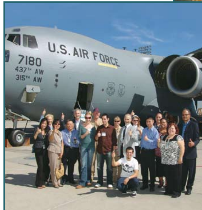
DRLC Disability Mentoring Day Participants at The Boeing Company