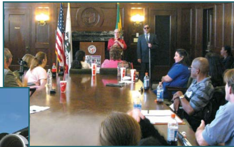
Disability Mentoring Day Participants at LA City Hall

Disability Mentoring Day (DMD) is a national program that promotes career development for students and job-seekers with disabilities through job shadowing and hands-on career exploration.